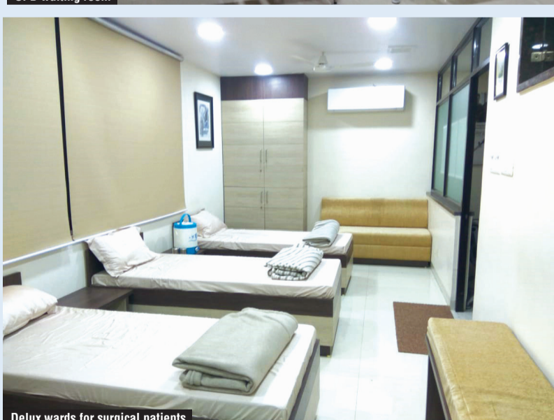
Deluxe wards for surgical patients