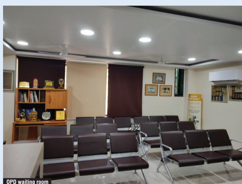
OPD waiting room