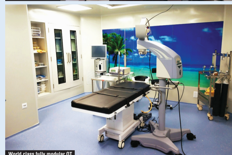
World class fully modular OT